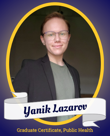
Graduate Feminist Activist Award for work with RISE Healthy for Life, Trans Affirming Care, and contributions to literature on gender and sexuality

Undergraduate Feminist Activist Award for work with PEER-iod ETSU