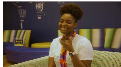
Frida Uwimana College of Business and Technology