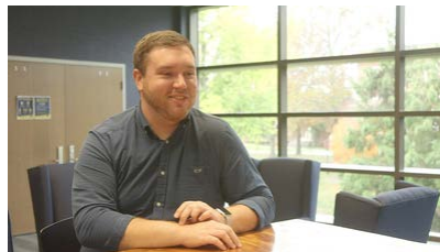
David Taylor Quillen College of Medicine