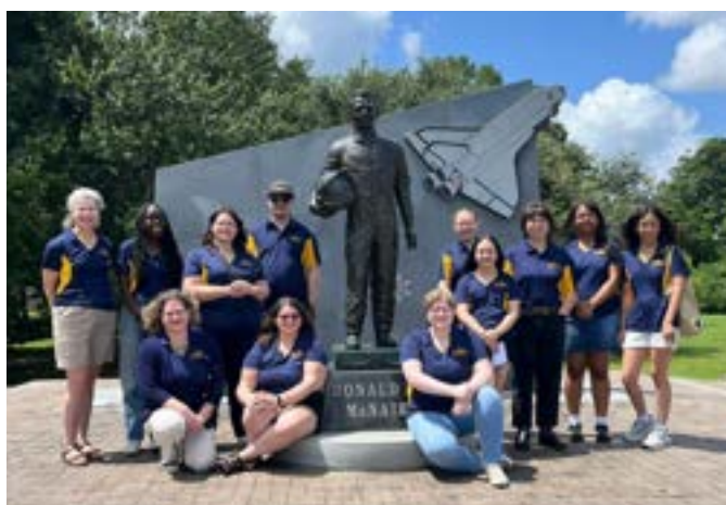
The McNair scholars visited Ronald E. McNair's hometown and life history museum over the summer.